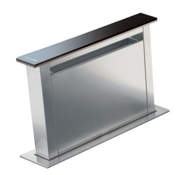
Hood S4000 Domino Ghost 2451 000